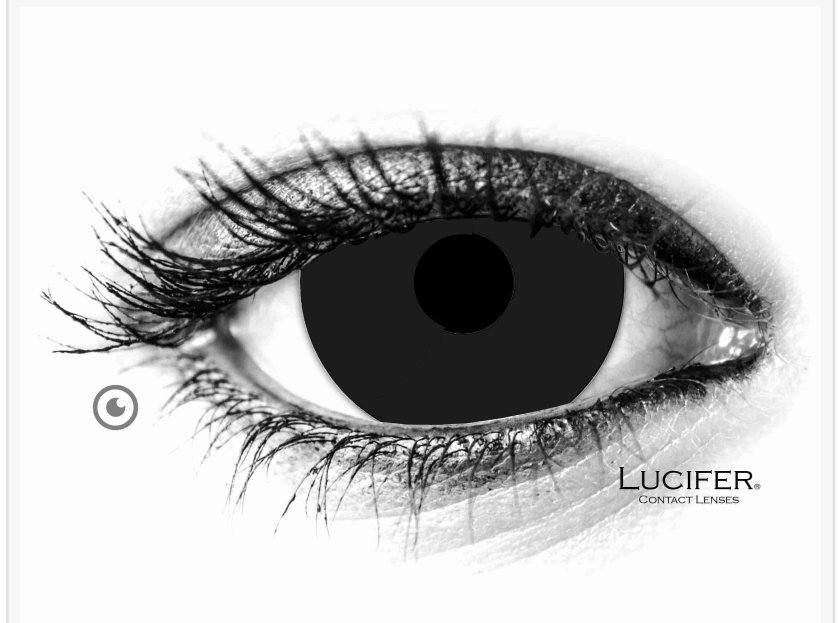
Mini Black Sclera - luciferlenses.co.uk