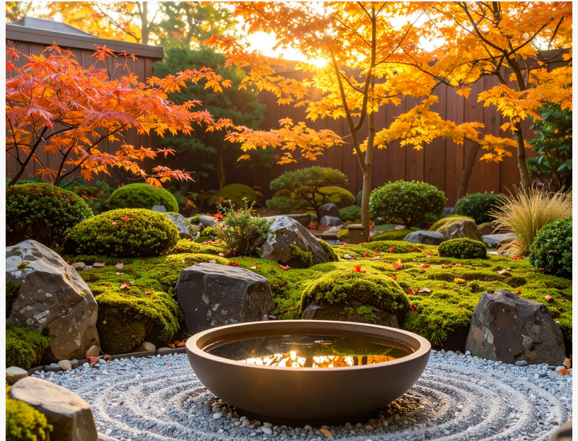
Tranquil Zen Gardens add Value to Property