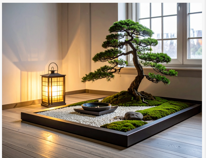
Green Zen leads the way in Biophilic Design in the UAE

“As the UAE positions itself as a global hub for wellness living, we see biophilic design not as a trend, but as the new standard,” McShane Bary added. “Green Zen is proud to lead this conversation, helping shape the future of real estate where sustainability, wellbeing, and profitability intersect.”