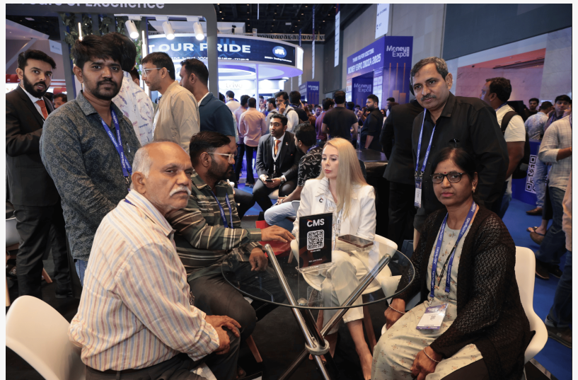
Visitors engaging in direct discussions with CMS Prime team at Booth #3 during Money Expo India 2025, reflecting trust and transparency.