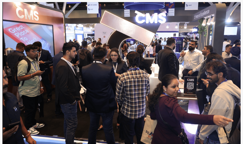
CMS Prime's Booth #3 was one of the most crowded and dynamic spots at Money Expo India 2025, attracting traders, investors, and industry leaders nonstop.

"This award is more than just a title—it is a testament to the values that CMS Prime has upheld for over 20 years. Transparency, trust, and technological innovation are the pillars of our success,