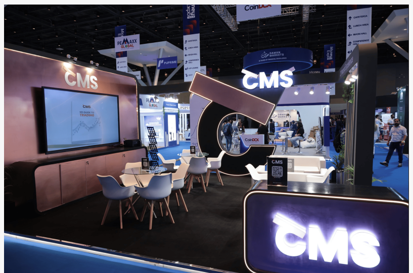
The sleek and modern CMS Prime Booth #3 at Money Expo India 2025, designed to reflect 21 years of excellence and innovation in global trading.

A major factor behind CMS Prime’s standout performance at the Money Expo was its elite staff. The CMS Prime team carried themselves with unmatched professionalism, representing the company’s values of integrity, client-focus, and excellence. Their presence at Booth #3 was more than just promotional—it was a demonstration of expertise and personalized service.