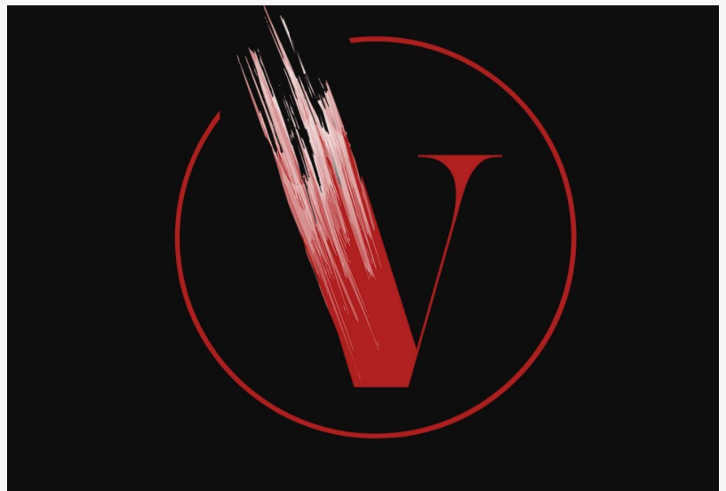
Visage Laser & Skin Care — Trusted leader in advanced non-surgical aesthetics since 2004.