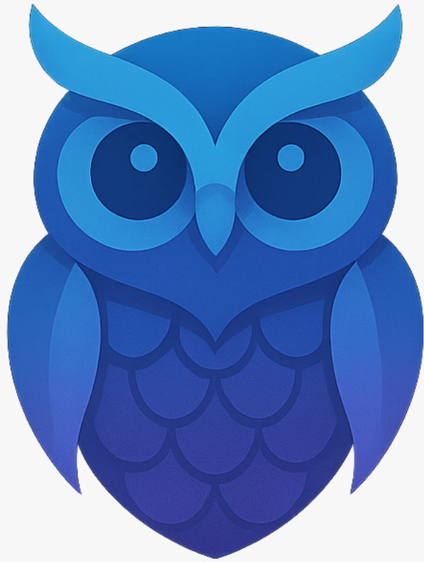
Consiliari AI Logo

The system identifies skill gaps that may be limiting career advancement and recommends specific learning paths, certifications, or experiences that could enhance professional value. It also highlights strengths that may be underutilized and suggests ways to better leverage these