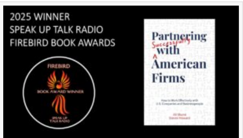
Best Business Book | Firebird Awards