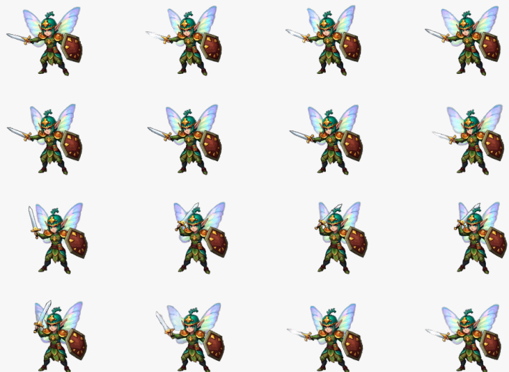
A 16-frame animated sprite sheet