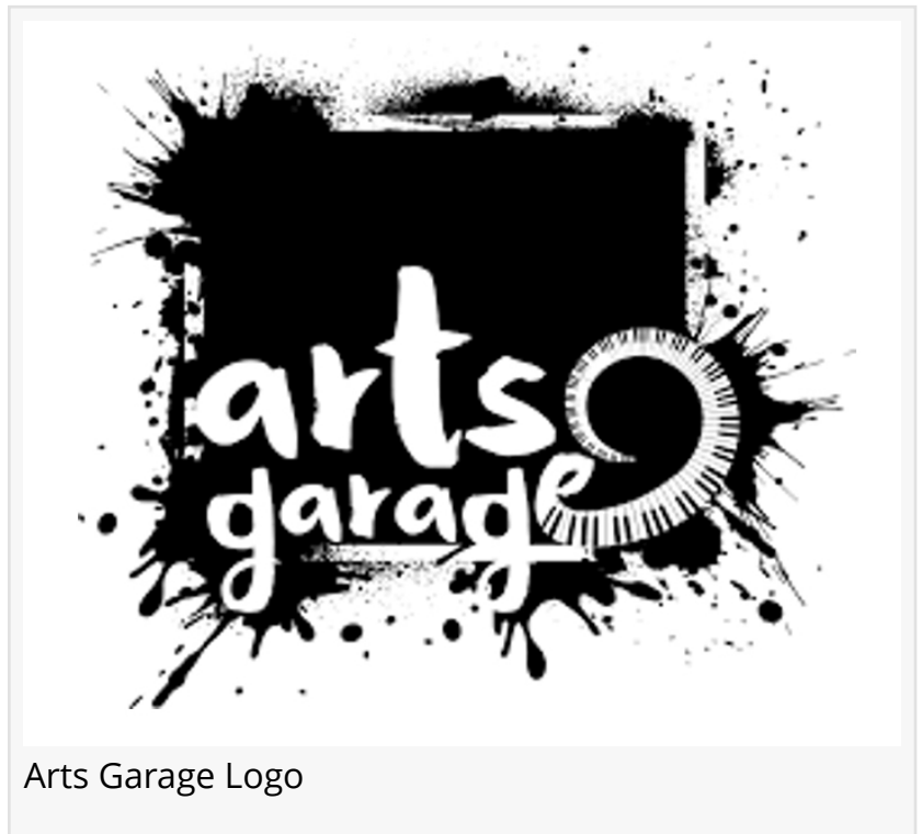
Arts Garage Logo