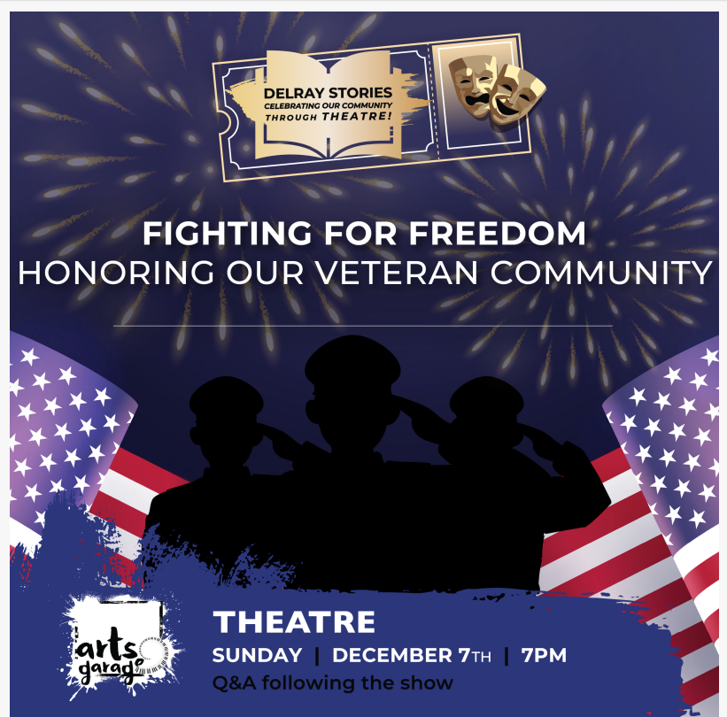
3rd Annual Delray Stories: Fighting for Freedom, Honoring Our Veteran Community

The Theatre Package is priced at $150 total, reflecting a 15% savings off single-ticket prices. Each package includes one ticket to all five productions in the 2025–2026 season. Performances are held at Arts Garage, located at 94 NE 2nd Avenue in Delray Beach's Pineapple Grove Arts District. Packages are available now and can be purchased here .