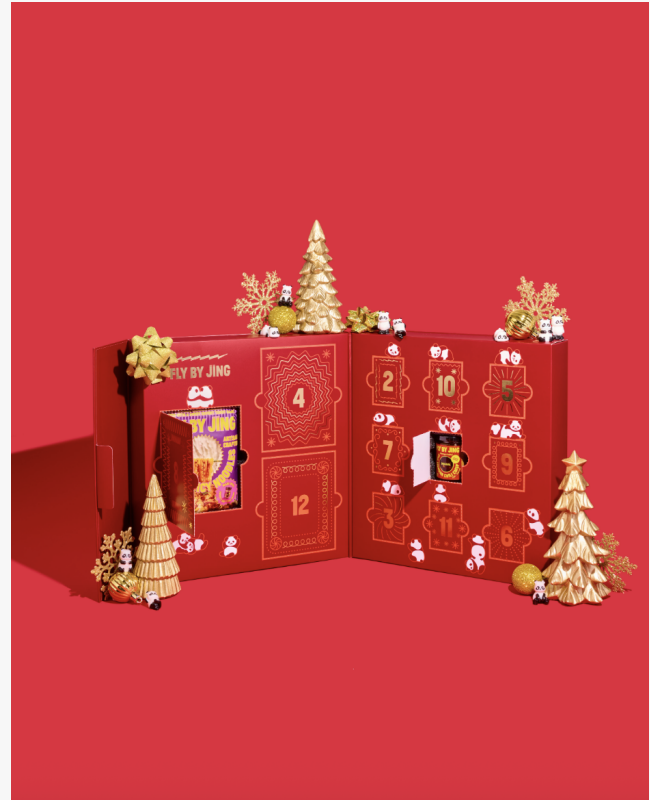
Fly By By Jing's 2025 Advent Calendar

The first and only Advent Calendar inspired by the flavors of Sichuan, this festive set has become Fly By Jing's bestselling holiday gift offering and is back by popular demand for the second year in a row after selling out a full two months before the holidays last year. Fully redesigned for 2025, the Advent Calendar arrives better than ever in gift-ready red and gold packaging adorned with giant pandas – the cultural symbol of Sichuan – and is packed with a brand new, curated lineup of Fly By Jing's boundary-pushing flavors. Each day reveals a new Fly By Jing product to discover, from cult classics like Original Sichuan Chili Crisp that introduced the condiment to American tables, to three flavors of bouncy, squiggly, saucy Noodles, plus never-before-launched items and more festive surprises available only in the calendar.