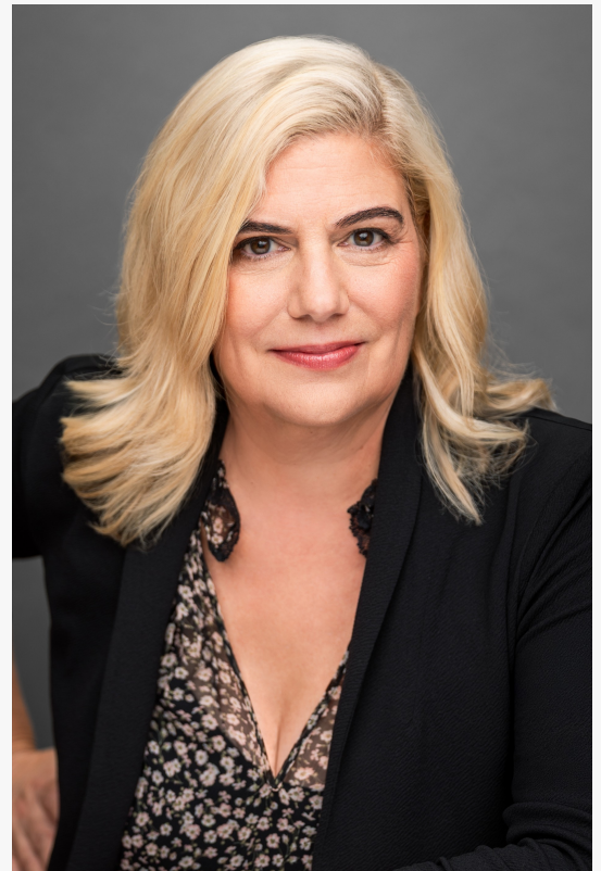
National Director of Tour Operations