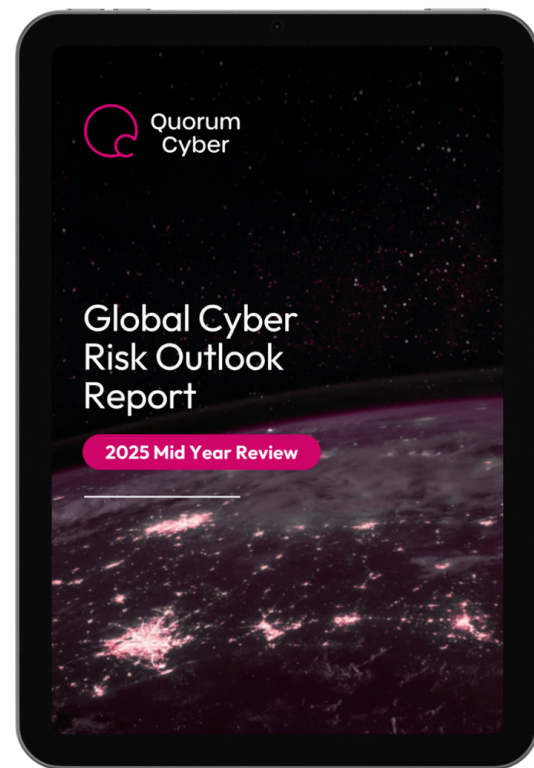
Relentless Threats: 2025 Mid-Year Global Cyber Risk Outlook Report