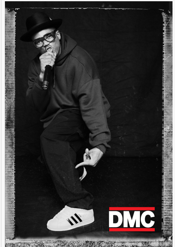
Darryl "DMC" McDaniels