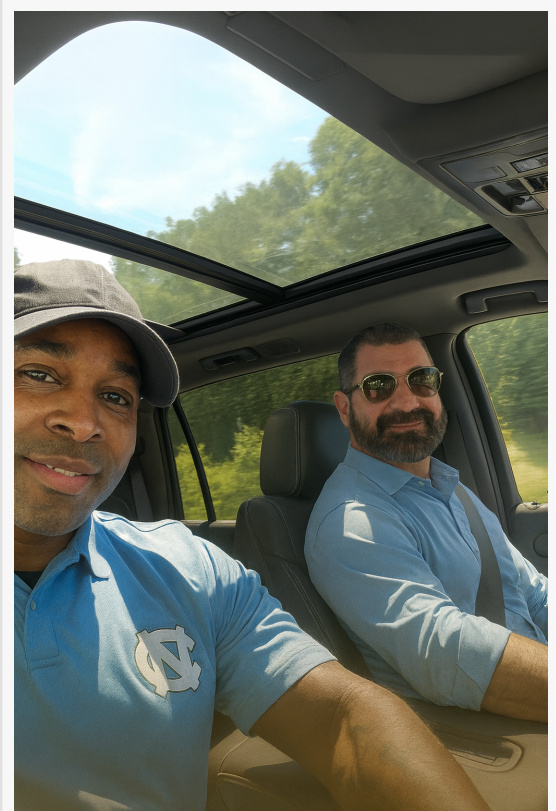
Driving to the Event

With established hubs in Raleigh, Washington, D.C., Dallas, and La Jolla, Axios Security Group continues to provide specialized services for high-value individuals, corporate executives, and public figures. Whether for a university sporting event, corporate summit, or international travel