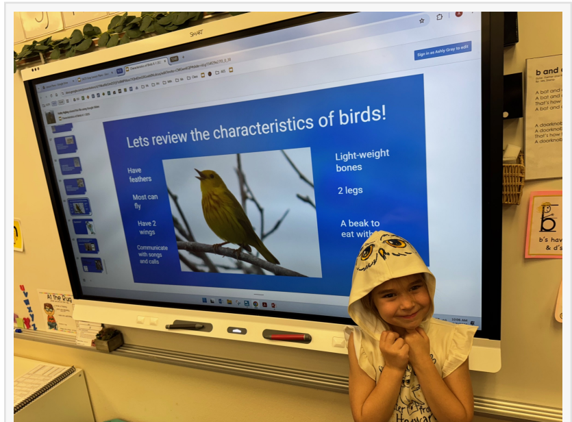
Birdfy Fund-Avalon Elementary School Collaboration- 4

This press release can be viewed online at: https://www.einpresswire.com/article/845610730