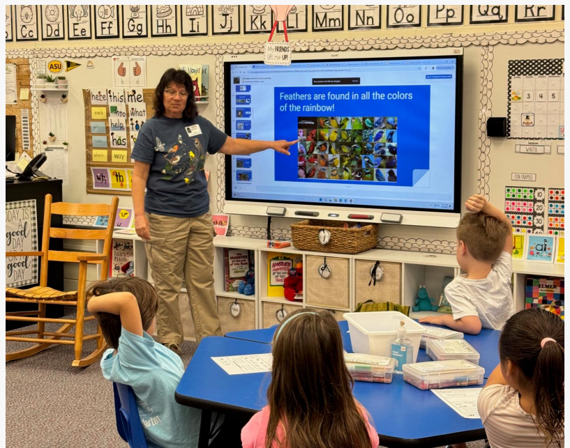
Birdfy Fund-Avalon Elementary School Collaboration3