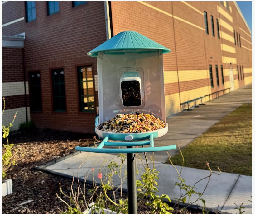
Birdfy Fund-Avalon Elementary School Collaboration1