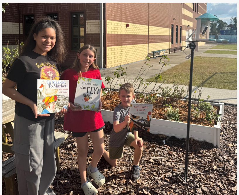
Birdfy Fund-Avalon Elementary School Collaboration2

Birdfy will continue to actively fulfill its social responsibility by expanding partnerships with more