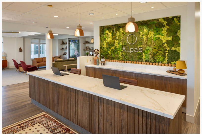
Alpas Wellness Maryland Recovery Center Front Desk

Ongoing education about the relapse process and warning signs