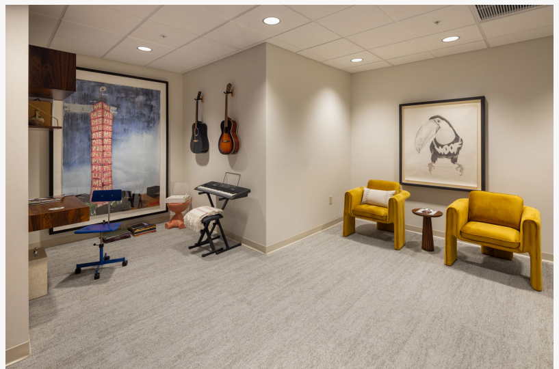
Alpas Wellness Maryland Recovery Center Music Room