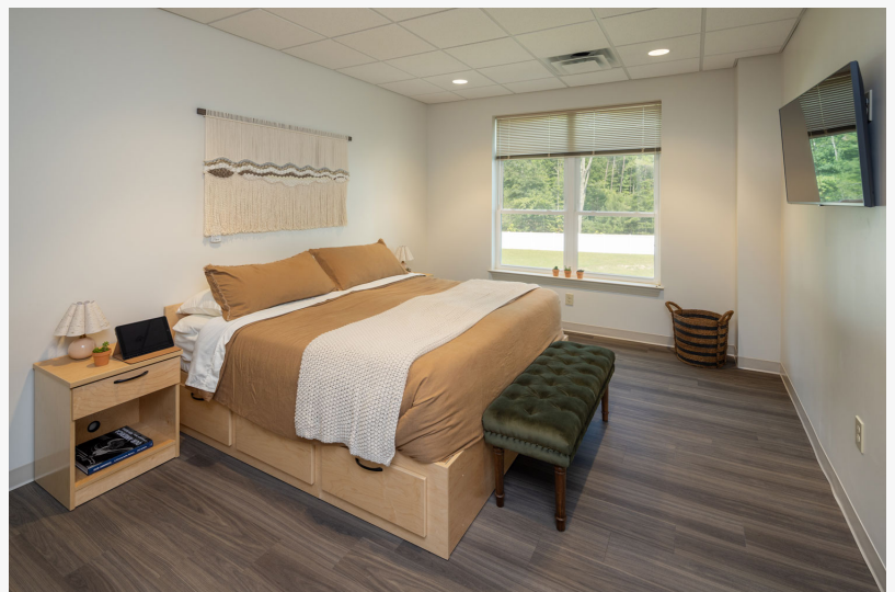
Alpas Wellness Patient Bedroom