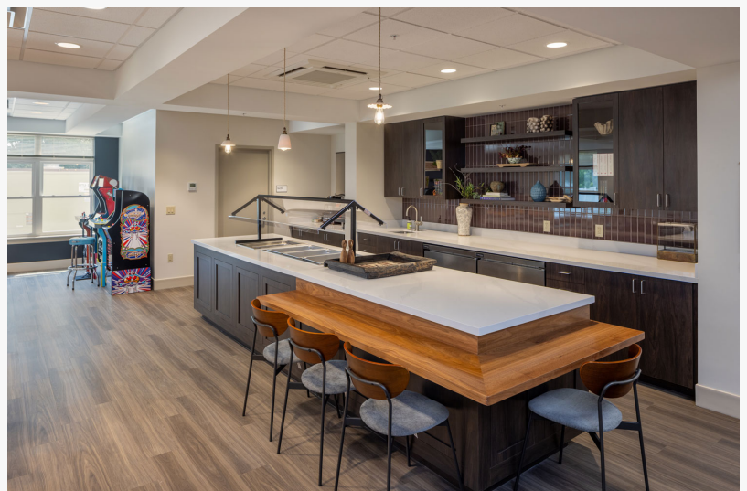
Alpas Wellness Maryland Recovery Center Cafe Area