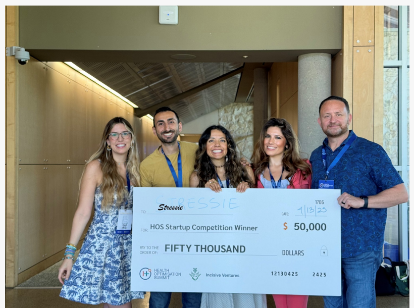
Startup grit, global stage, Stressie claims $50,000 win, redefining resilience with purpose and precision

Stressie is built for scale at the personal level and across global workforces. It is already available on the Apple App Store and is actively being adopted by organizations across industries. Its adaptive architecture enables seamless integration across small businesses and multinational enterprises. The platform supports both HR professionals and leadership teams shaping tomorrow’s workplace culture. Behind Stressie is not just a founder, but a first-generation Latina innovator who studied behavioral economics at Harvard, built her company from the ground up, and now stands as a global voice for scalable mental wellbeing.