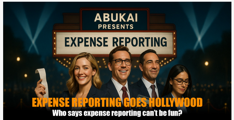
Expense Reporting Goes Hollywood