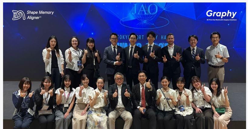
Graphy team with international attendees at JAAO 2025 in Tokyo, showcasing strong collaboration and global presence.

At the annual meeting of the Japan Academy of Aligner Orthodontics (JAAO), Korean dental materials company Graphy Inc. presented new clinical data demonstrating the effectiveness of its flagship solution, Graphy Aligner. The event marked the company's most significant introduction to the Japanese orthodontic community to date.