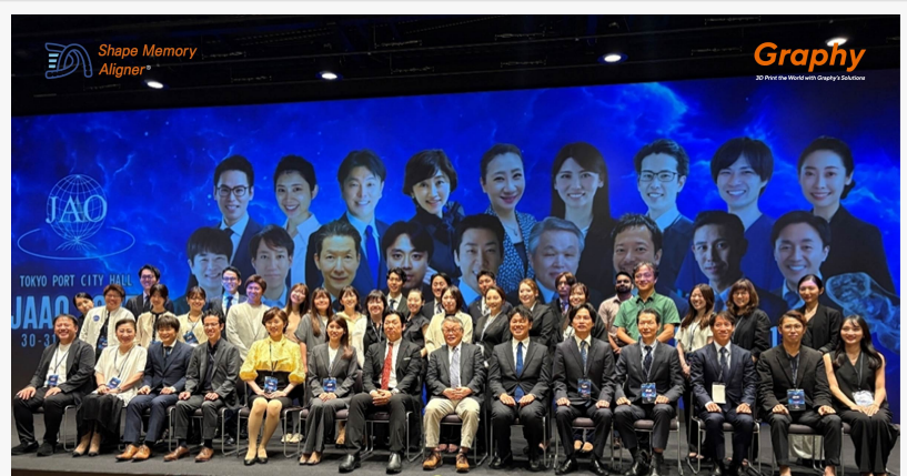
Group photo of speakers, clinicians, and participants at the Japan Academy of Aligner Orthodontics 2025 annual meeting.

Graphy announced continued investment in automation, resin quality improvement, and international patent expansion. Recent accolades, including an award from Korea's Ministry of