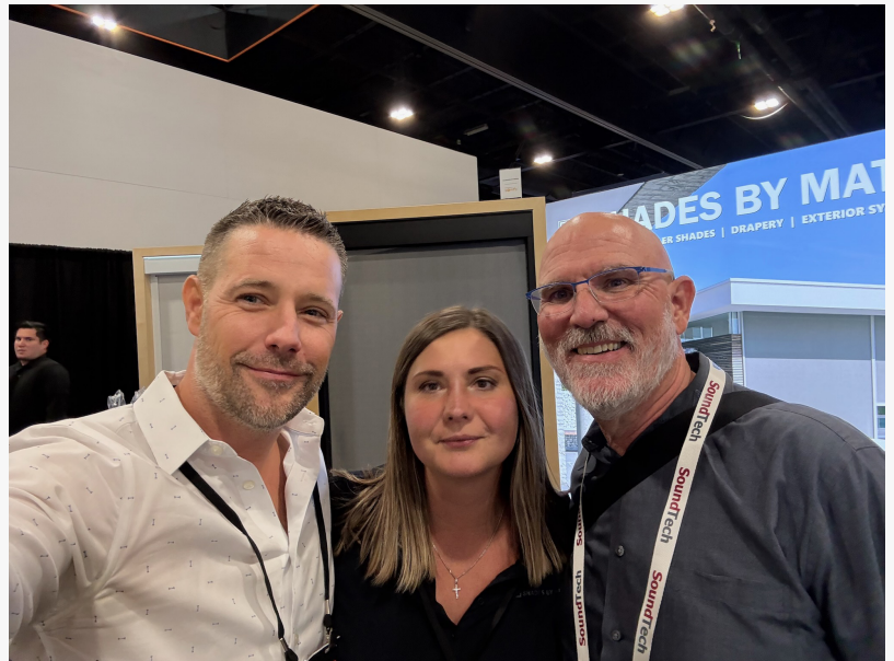
Shades by Matiss and Sound Tech at CEDIA EXPO in Denver, CO

About Shades by Matiss Celebrating 25 Years of Excellence