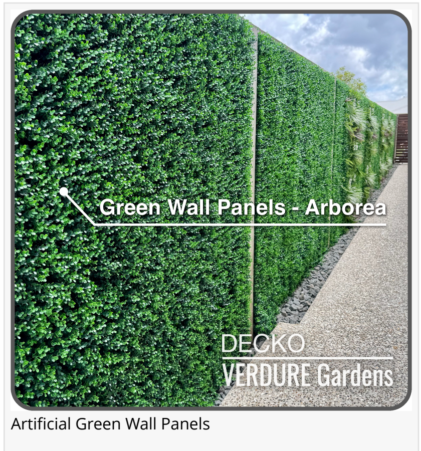
Artificial Green Wall Panels

About DECKO: Founded in 2013, DECKO is a DIY-first home-improvement brand with operations