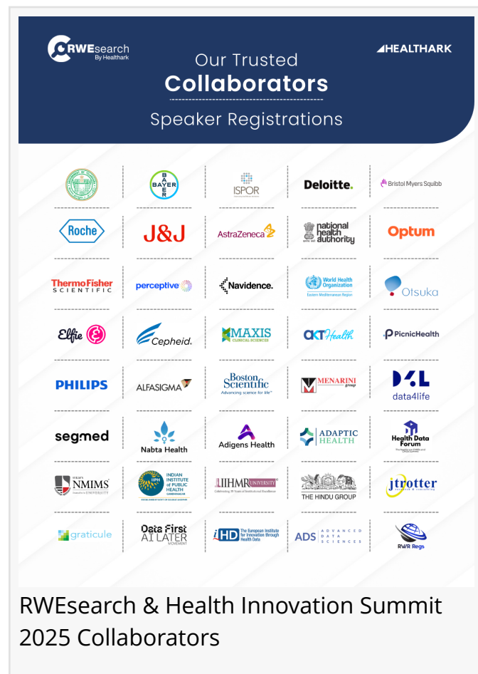
RWEsearch & Health Innovation Summit 2025 Collaborators

Across three days, the summit will cover a wide spectrum of topics. Discussions will include factors driving growth of life sciences Global Capability Centers (GCCs) & the impact they are generating on driving healthcare outcomes across the world, strategies to improve diversity in clinical research, new approaches to real-world data strategies, and innovations in digital health ecosystems across the world, with specific tracks focused on India, Middle East and Africa. Sessions will also focus on the future of healthcare education, personalized cell therapy, next-generation validation for medical devices, commercial realities for biotechs, and big pharma.