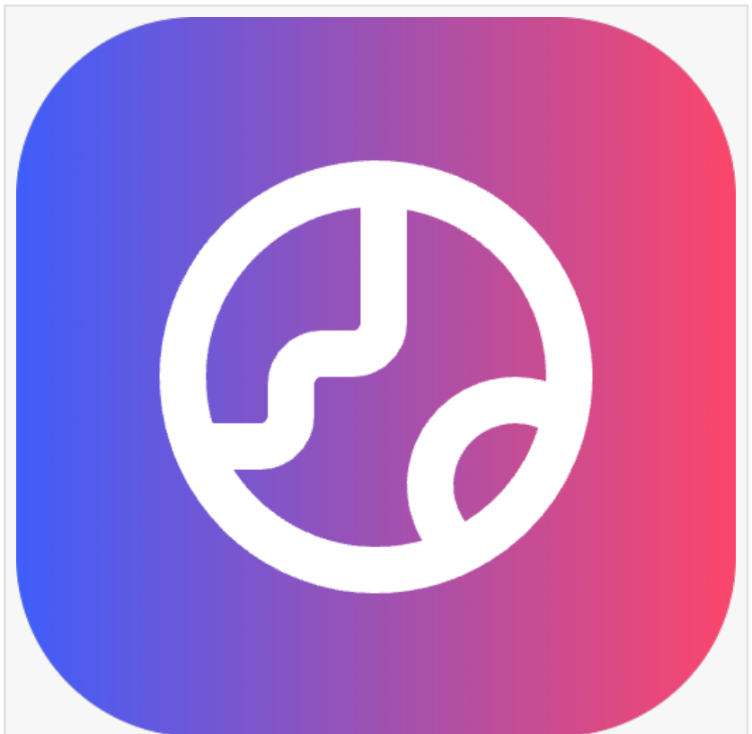
GPT Proto Logo