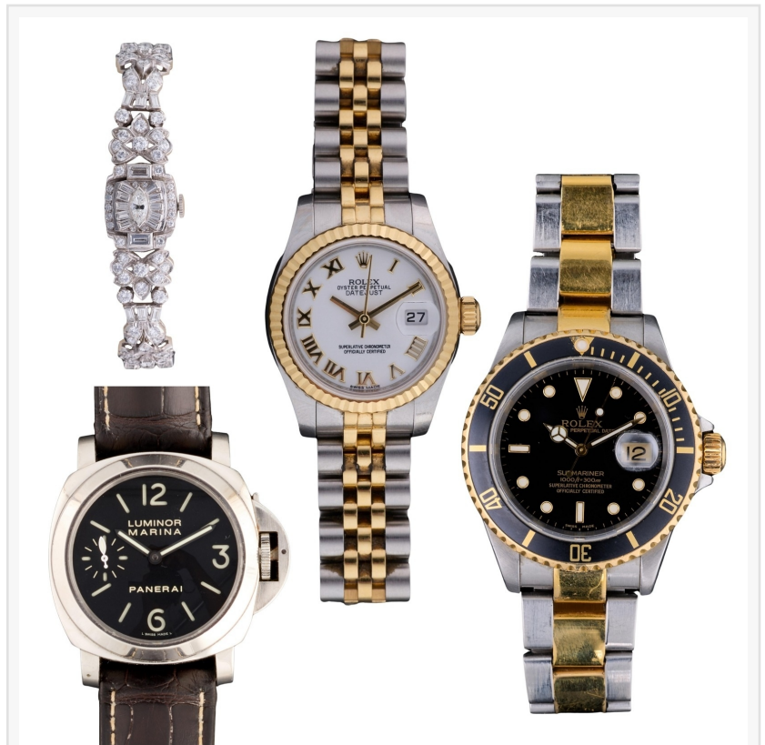
The auction features a selection of fine watches (including various Rolex examples).

Returning to original artworks, there are several paintings in the auction by Alexander John Drysdale (La., 1870-1934). One is a 1916 oil on canvas titled Autumn Evening After a Shower (estimate: $15,000-$25,000). Also, lot #362 consists of a pair of oils on