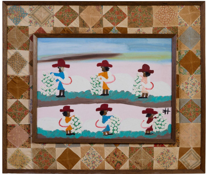
Vibrant, original oil painting by the legendary Louisiana folk artist Clementine Hunter (1887-1988), titled Picking Cotton (estimate: $4,000-$8,000).