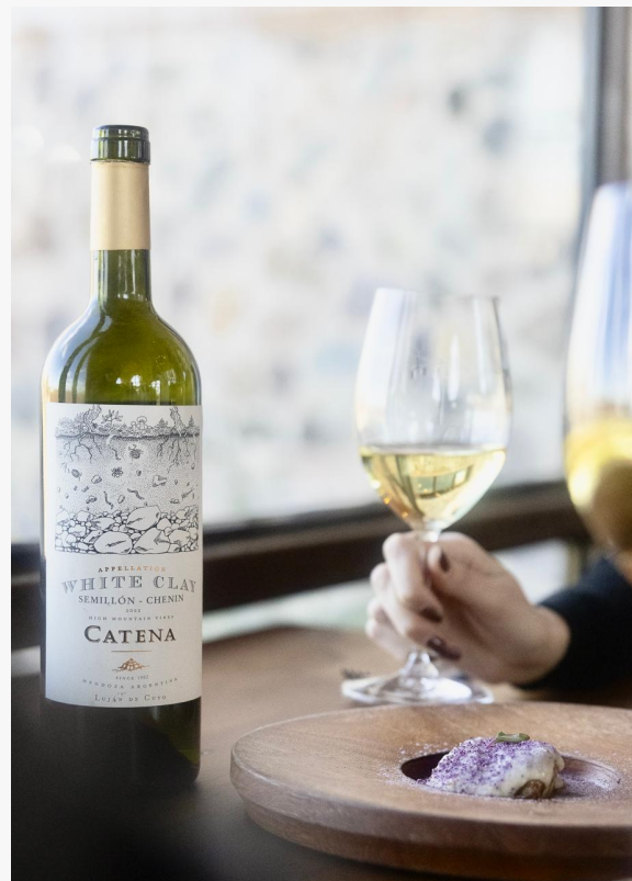
Catena Appellation White Clay Semillon Chenin Blend