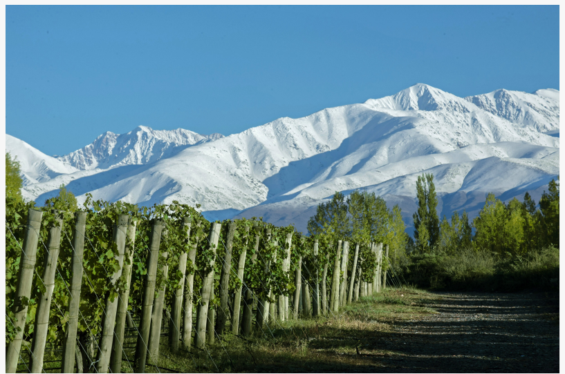
Argentina’s high altitude region is considered cool climate

Semillon and Chenin Blanc have grown the most, starting from a small base. These grape