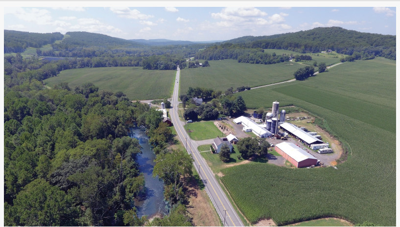
3,900+/- Ft Along Musconetcong River

POHATCONG TOWNSHIP, NJ, UNITED STATES, September 6, 2025 /EINPresswire.com/ -- Max Spann Real Estate & Auction Co. is pleased to announce a rare auction event featuring a 186.87± acre preserved farm along the Musconetcong River in Pohatcong Township , Warren County, NJ. This scenic property will be sold in a live, on-site Auction on October 8, 2025 with simulcast online bidding available.