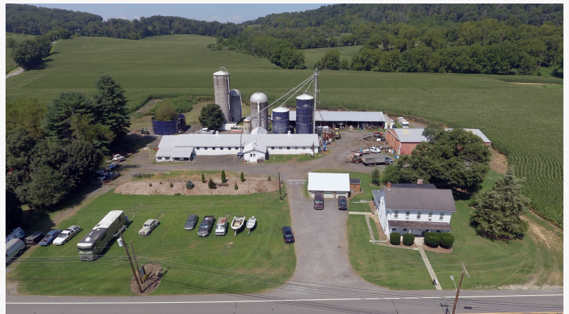
Former Dairy Barn with Machinery Garage