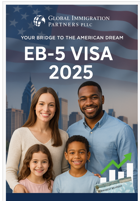
EB5 Green Card, EB5 Regional Center

For more information on the EB-5 Regional Center program and how Global Immigration Partners can support your U.S. immigration journey, visit