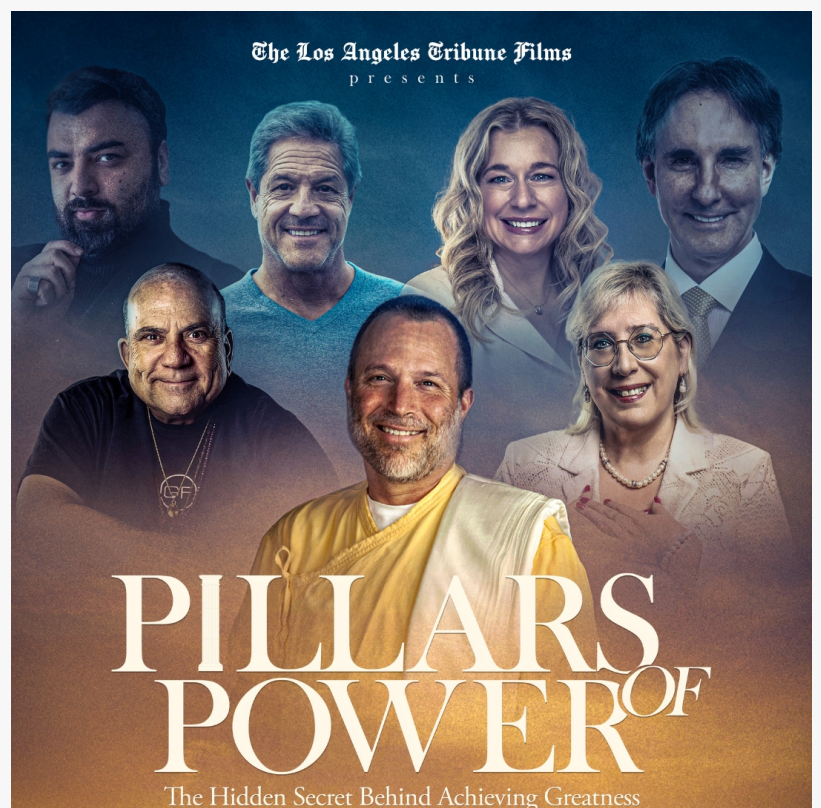
The Pillars of Power