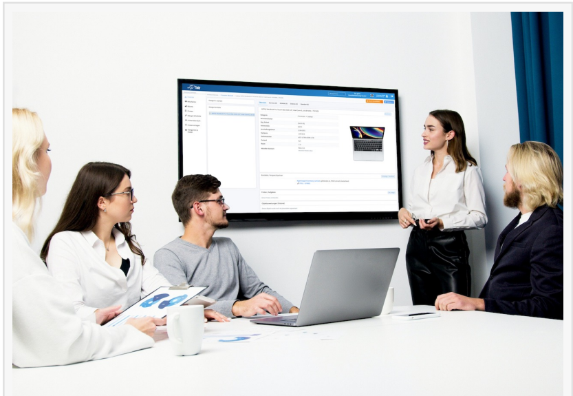
Timly's Inventory Management Software Is Being Used by Hundreds of Companies