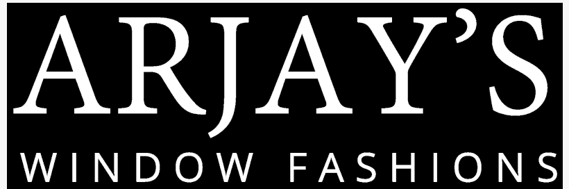
Arjay's Window Fashions Logo

CHANDLER, AZ, UNITED STATES, October 1, 2025 /EINPresswire.com/ -- Arjay's Window Fashions, a trusted provider of custom window treatments across Arizona and Southern California, has officially launched its newly redesigned website. The updated platform is built to simplify the way homeowners and businesses explore premium blinds, shades, shutters, and drapery —while making it easier to book personalized in-home consultations .