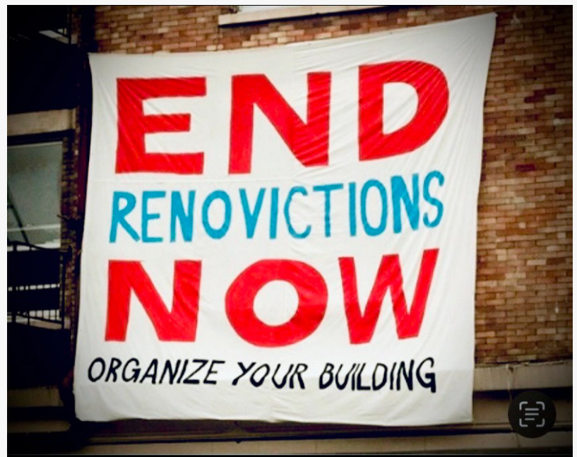
End Renovictions Now