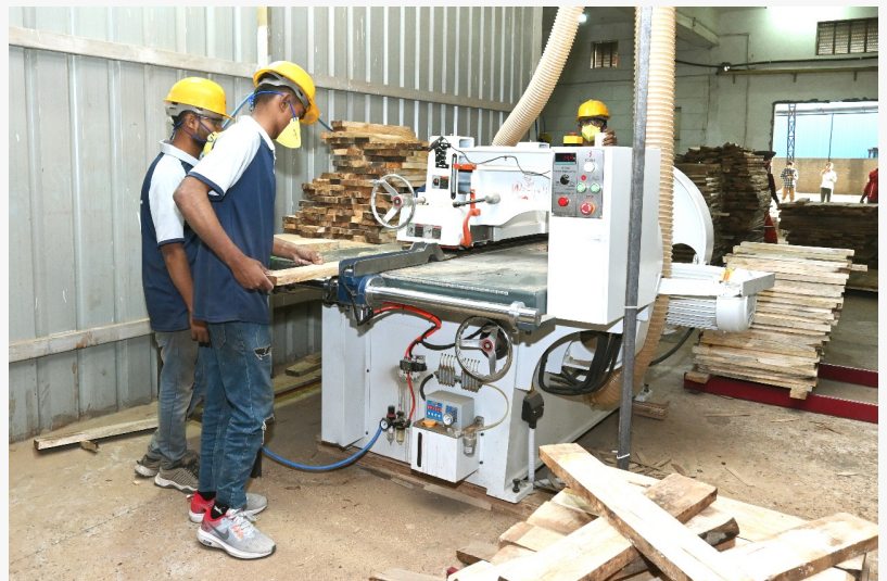
Elcasa Group's state-of-the-art manufacturing facility powering global FF&E projects.