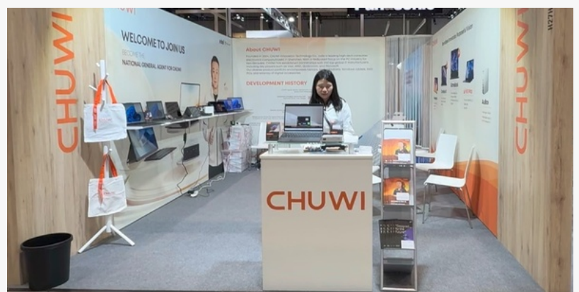
CHUWI booth in IFA

The highly anticipated AuBox Mini PC, a versatile and high-performance mini gaming computer, offers multiple configuration options. The new model is equipped with an AMD Ryzen 7 8745HS processor, 32GB DDR5 RAM, and a 1TB PCIe SSD, delivering outstanding speed and energy efficiency. Since its launch, the product has achieved robust sales performance, exceeding market expectations and earning widespread user acclaim. For detailed product information,