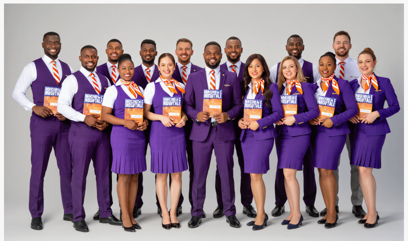
Imagine being among the first group of Flight Ready Academy Graduates