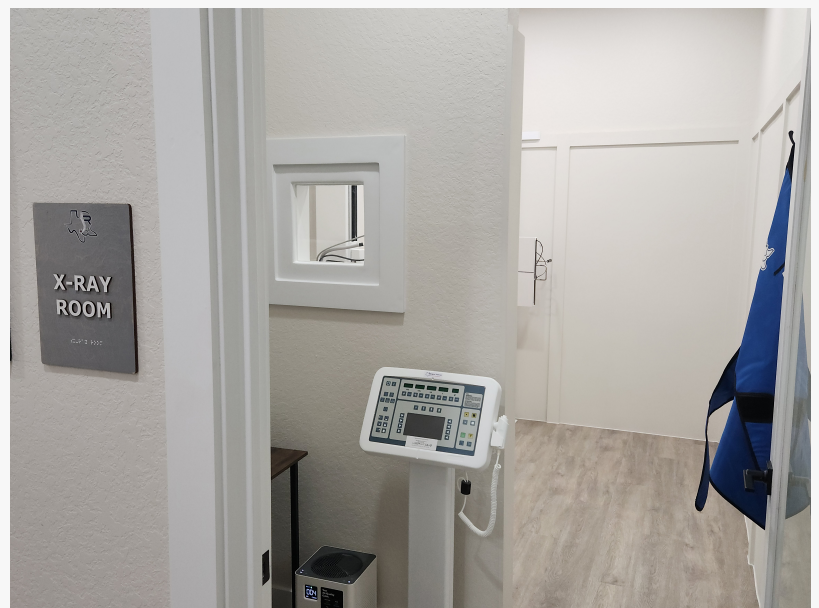
Renew Texas Family Chiropractic X-Ray Room

EINPresswire.com/ -- Renew Texas Family Chiropractic announced today its commitment to evidence-guided chiropractic care using on-site digital X-rays to help families across the San Antonio area get clearer answers, faster relief, and longer-lasting results. By visualizing the spine and surrounding structures, the clinic's doctors can identify the true source of pain or dysfunction and tailor care plans for each individual.