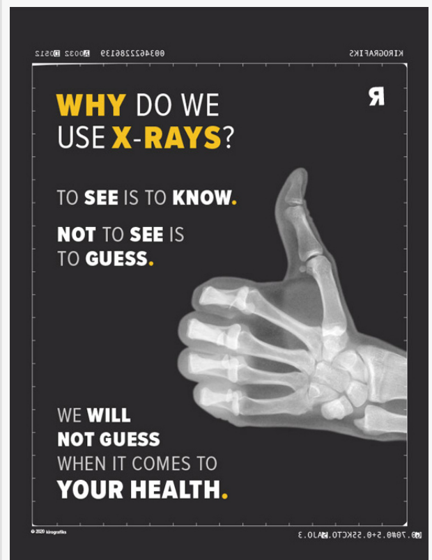
Why X-rays are important in Chiropractic Care