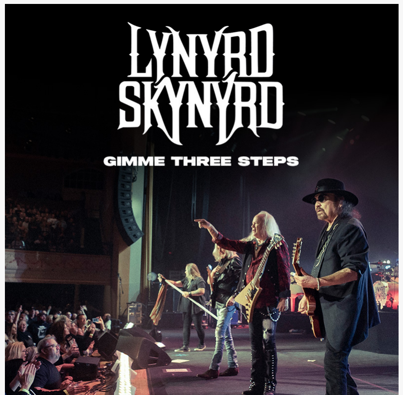
Lynyrd Skynyrd, "Gimme Three Steps" (Frontiers Music SRL)

The new album showcases the band's unparalleled energy and their signature blend of blues rock and Southern hard rock swagger, putting a spotlight on Lynyrd Skynyrd's lasting legacy in music history, filled with iconic hits such as "Freebird," "Sweet Home Alabama," "Simple Man," and so many more. "Celebrating 50 Years - Live at the Ryman" also features guest appearances by Jelly Roll, Marcus King, John Osborne (The Brothers Osborne), Brent Smith (Shinedown), and Donnie Van Zant (Van Zant & .38 Special).