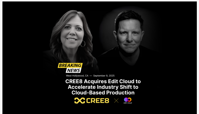
CREE8 acquires Edit Cloud

transforming how creative teams work, today announced the acquisition of Edit Cloud, a UK-based cloud production specialist and enterprise onboarding provider. The move strengthens CREE8's global capabilities and addresses an urgent industry need: to move to the cloud or risk falling behind.