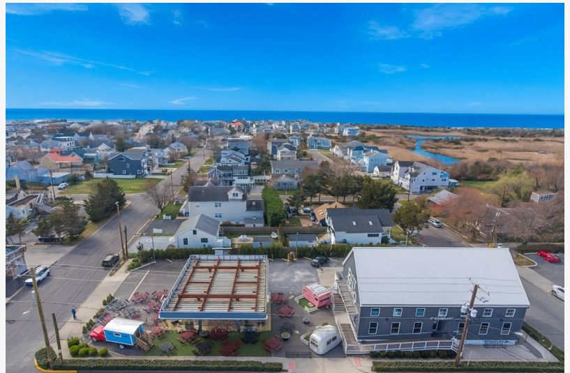
The Exit Zero Filling Station at 110 Sunset Boulevard, West Cape May — available at online auction through Tranzon Auction Properties

CAPE MAY, NJ, UNITED STATES, September 10, 2025 / EINPresswire.com/ -- Cape May's treasured Exit Zero Filling Station, located at 110 Sunset Boulevard, is up for Auction Sale, marking the end of an era for fans of the well known culinary hot spot. The sale of the Exit Zero Filling Station does not have an impact on the publication of the long-running magazine, Exit Zero. Tranzon Auction Properties is handling the sale scheduled for October 1, 2025.