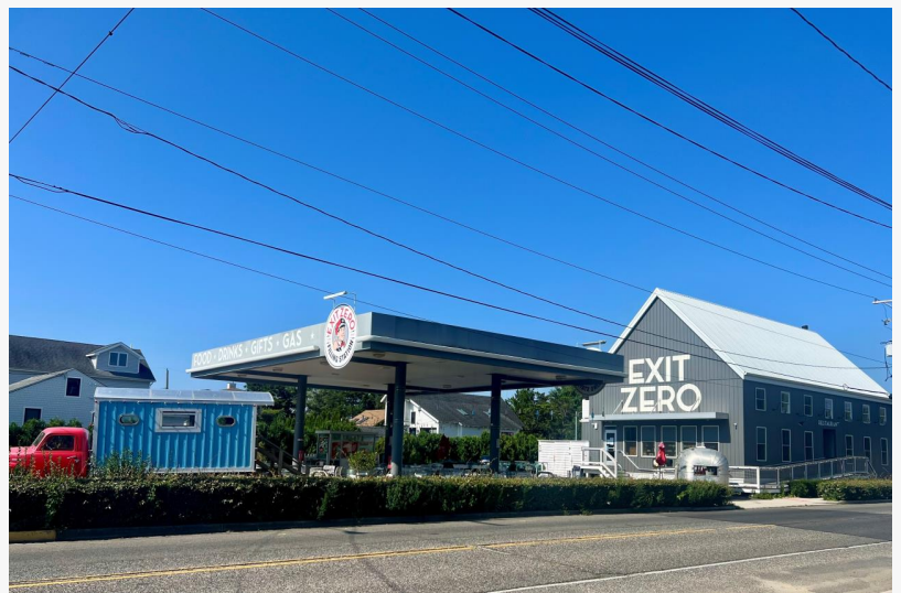
Front view of the Exit Zero Filling Station, a block-wide commercial property with C-3 zoning, slated for auction October 1, 2025.