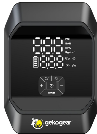
GekoGear's AirFlux 300

EINPresswire.com/ -- GekoGear, an Adesso brand, today announced the launch of the AirFlux 300 and AirFlux 100 , two innovative devices designed to keep drivers and adventurers prepared for any situation, delivering convenience, reliability, and versatility. The AirFlux 300 combines a powerful air pump and jump starter, while the AirFlux 100 offers compact, reliable inflation for on-the-go needs, from car and bicycle tires to sports equipment.