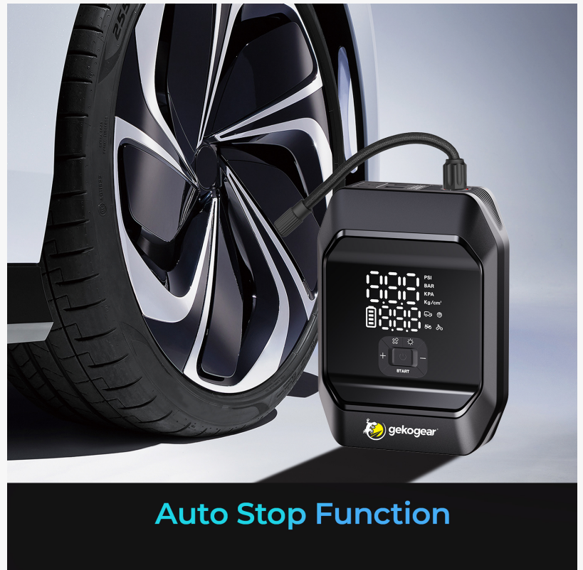
AirFlux 300 Auto Stop Function