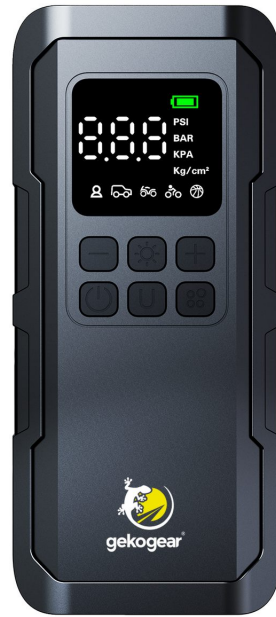
GekoGear's AirFlux 100

The AirFlux 300 offers unmatched versatility, combining tire inflation and vehicle jump-starting capabilities in one compact device. Its user-friendly design and multi-functional features provide peace of mind for drivers, outdoor enthusiasts, and anyone in need of a reliable power solution on the go. The AirFlux 300 delivers premium functionality at an accessible price point, making it a must-have for safety-conscious consumers.