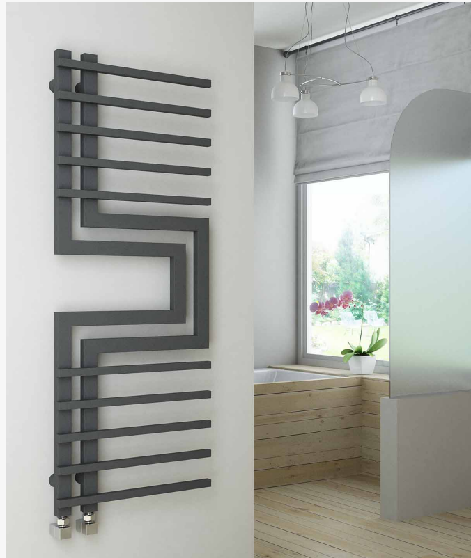
SLIZZA Designer Towel Radiator