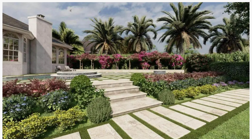
Landscape Design in Marin County