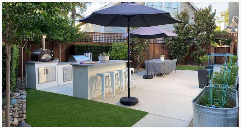
Landscape Design in Napa County

Professional landscape adaptation during this period typically involves several key considerations: