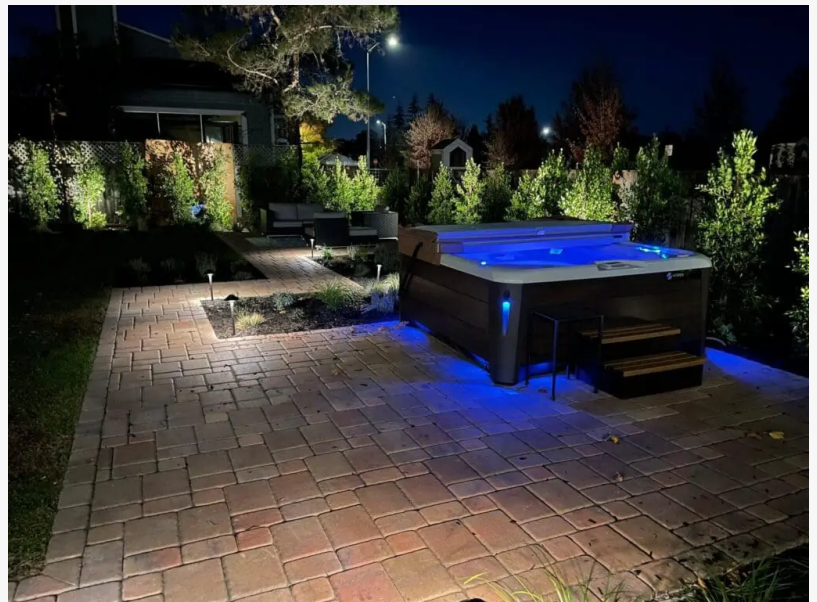
Landscape Design in Sonoma County