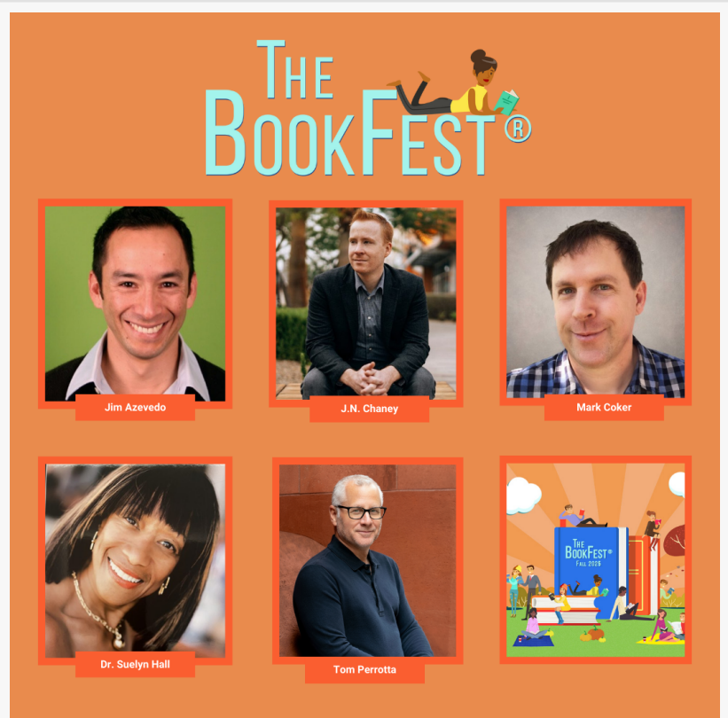
TheBookFest Fall 2025 Speakers