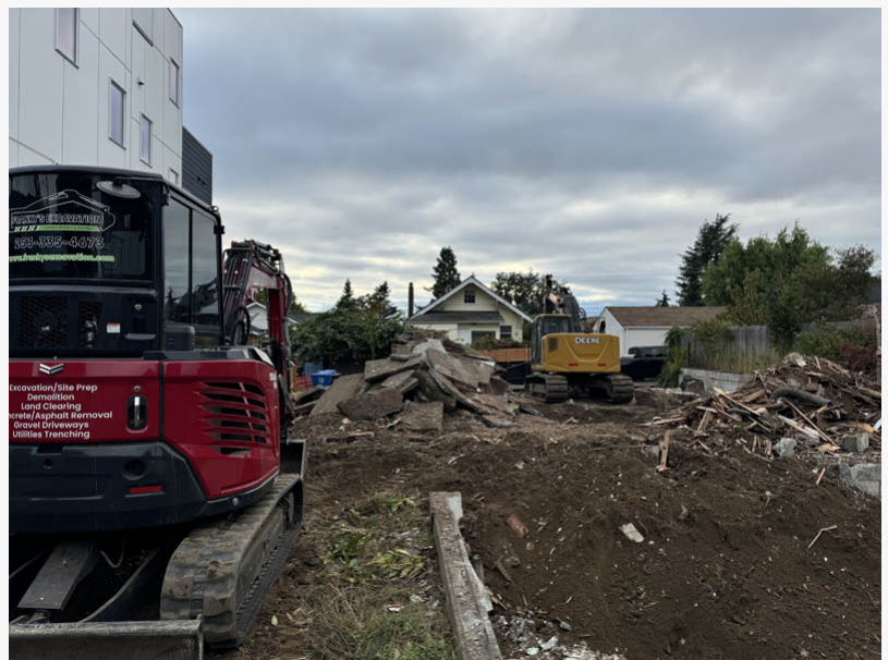
concrete removal and commercial property demolition with franky's excavation

Franky's Excavation is a local company that provides professional demolition services in Pierce County . They help homeowners and builders prepare land for new projects by safely removing