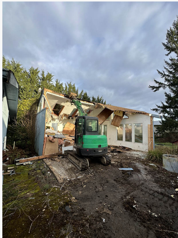
semi commercial building demolition with franky's excavation in pierce county