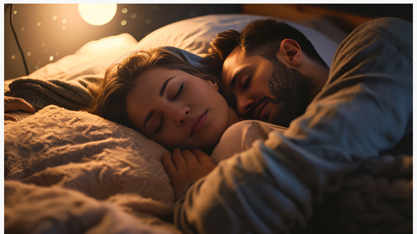
Better Sleep With Zyppah