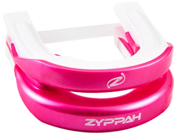
Anti Snoring Device