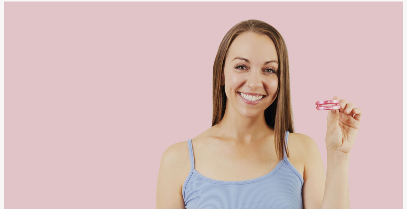
Helping Women Sleep Better