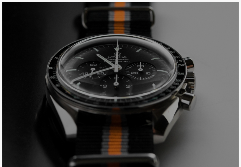
The Omega Speedmaster Professional, famously worn during the Apollo 11 mission, stands as the first watch on the Moon—an enduring symbol of exploration, resilience, and human achievement.

role in space exploration made it more than a watch; it became a symbol of human ingenuity.