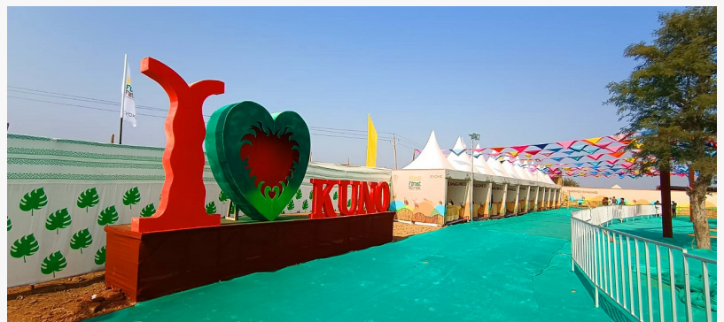
Kuno Forest Retreat