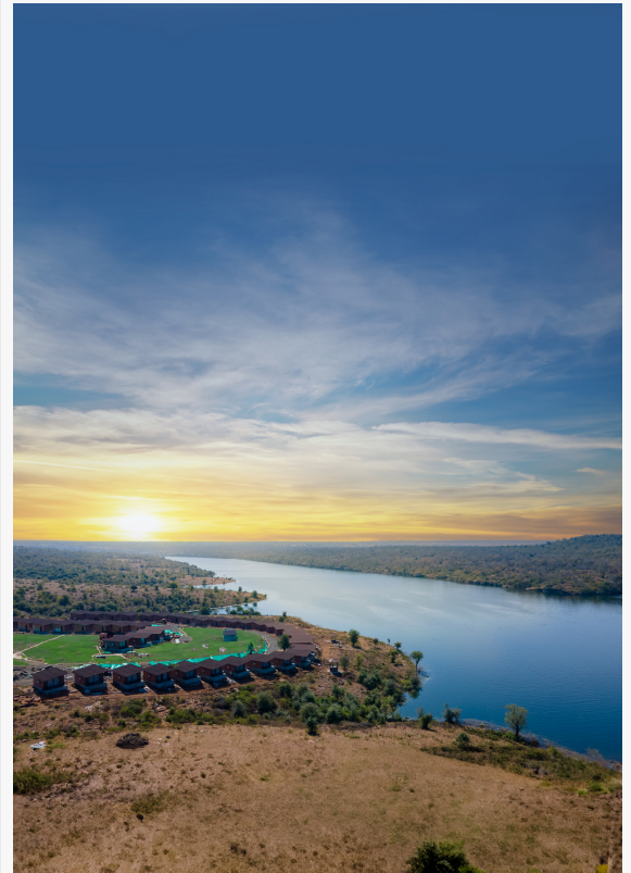
Drone View of the Gandhi Sagar Forest Retreat

Kuno Forest Retreat & Festival: Eco-Tourism Rooted in Conservation