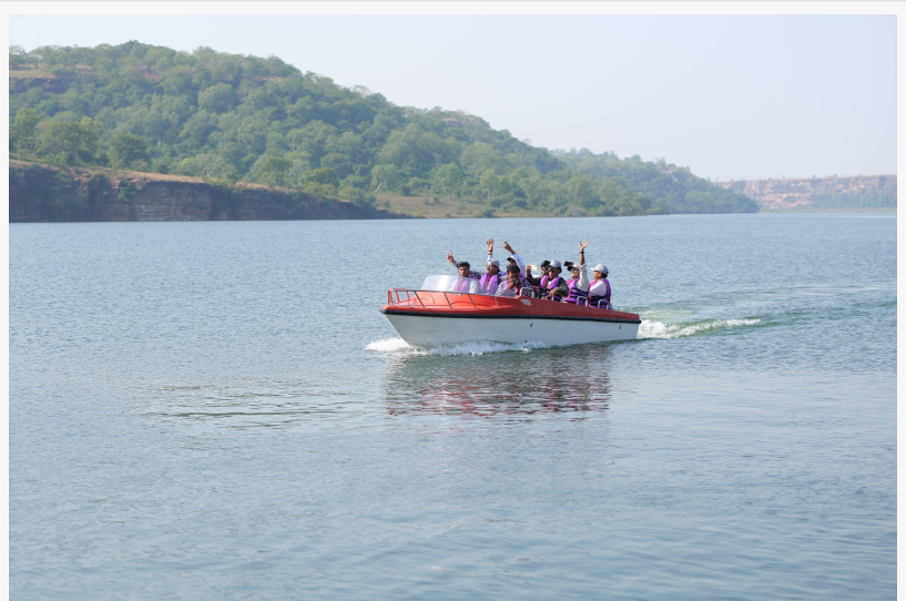
Water Activities at the Gandhi Sagar Forest Retreat