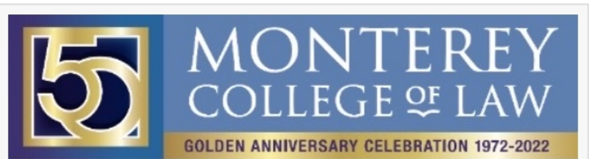
MCL 50th Logo

Mitchel Winick SideBar Media +1 831-241-8999 email us here