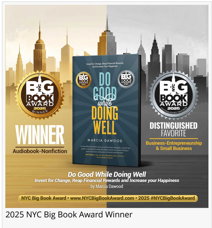
2025 NYC Big Book Award Winner

The competition is judged by experts from different aspects of the book industry, including publishers, writers, editors, designers, booksellers, librarians and professional copywriters. Winners and distinguished favorites are based on overall excellence.