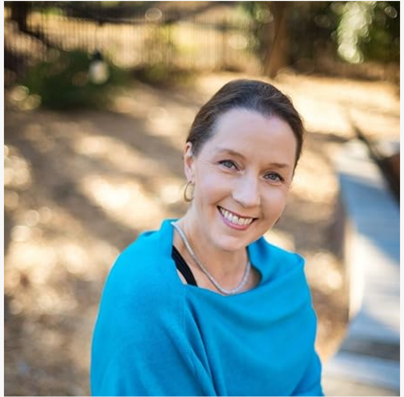
Author Marcia Dawood

This book serves as your comprehensive “why-to” manual for angel investing, illuminating how your individual financial contributions can go far beyond monetary value. Whether you’re new to investing or simply looking to align your portfolio with your values, Do Good While Doing Well will equip you with the necessary tools and knowledge.