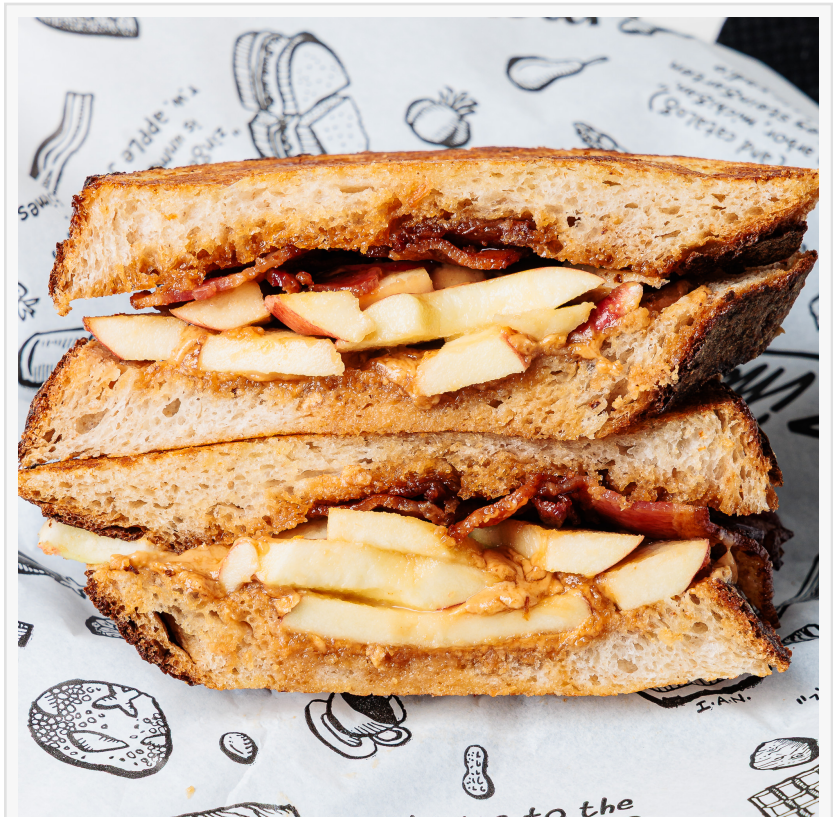
Zingerman's Apple-solutely Koeze - October 2025 Sandwich of the Month

This press release can be viewed online at: https://www.einpresswire.com/article/849310701