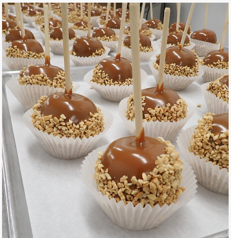
Koeze Cashew Caramel Apples