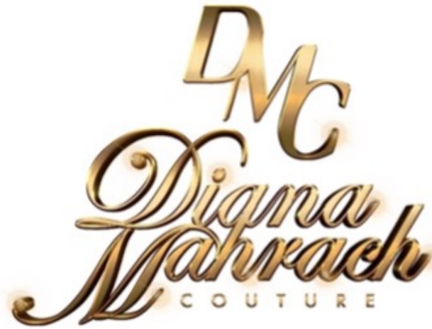
Diana Mahrach Couture Logo

EINPresswire.com/ -- "Fashion Runway" is an immersive evening this Thursday, September 18th, 2025 celebrating high fashion. The centerpiece of the night will be a runway presentation by Diana Mahrach Couture, showcasing the latest in haute couture craftsmanship. The event will benefit The Centre for Family Services Palm Beach County (CFS), known for their signature annual fundraiser, The Old Bags Luncheon.