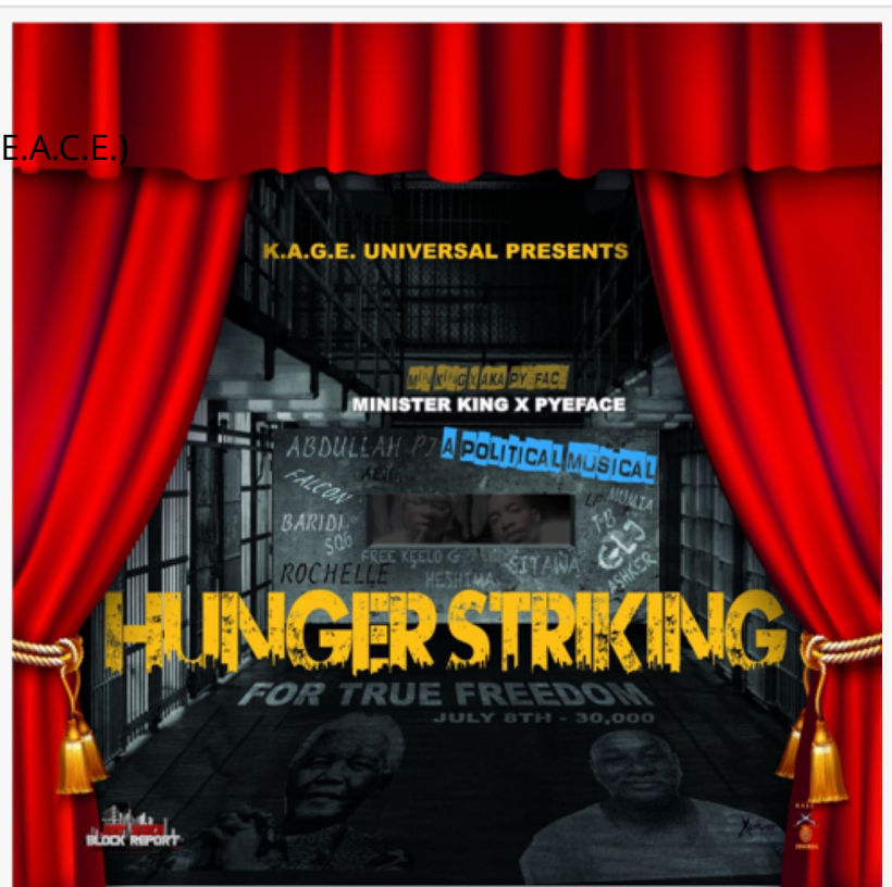
Cover Image to Minister King X Pyeface, Political Musical, Hunger Striking for True Freedom

This press release can be viewed online at: https://www.einpresswire.com/article/849348591