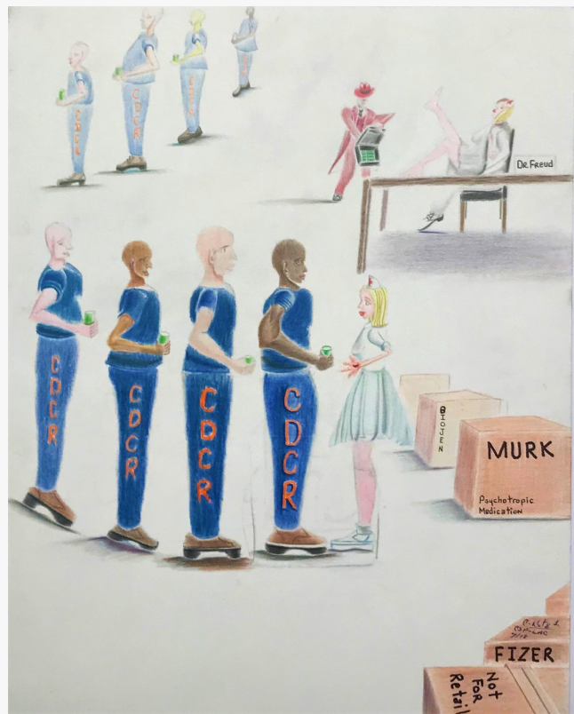
C-Note's 2018, Capitalizing Justice